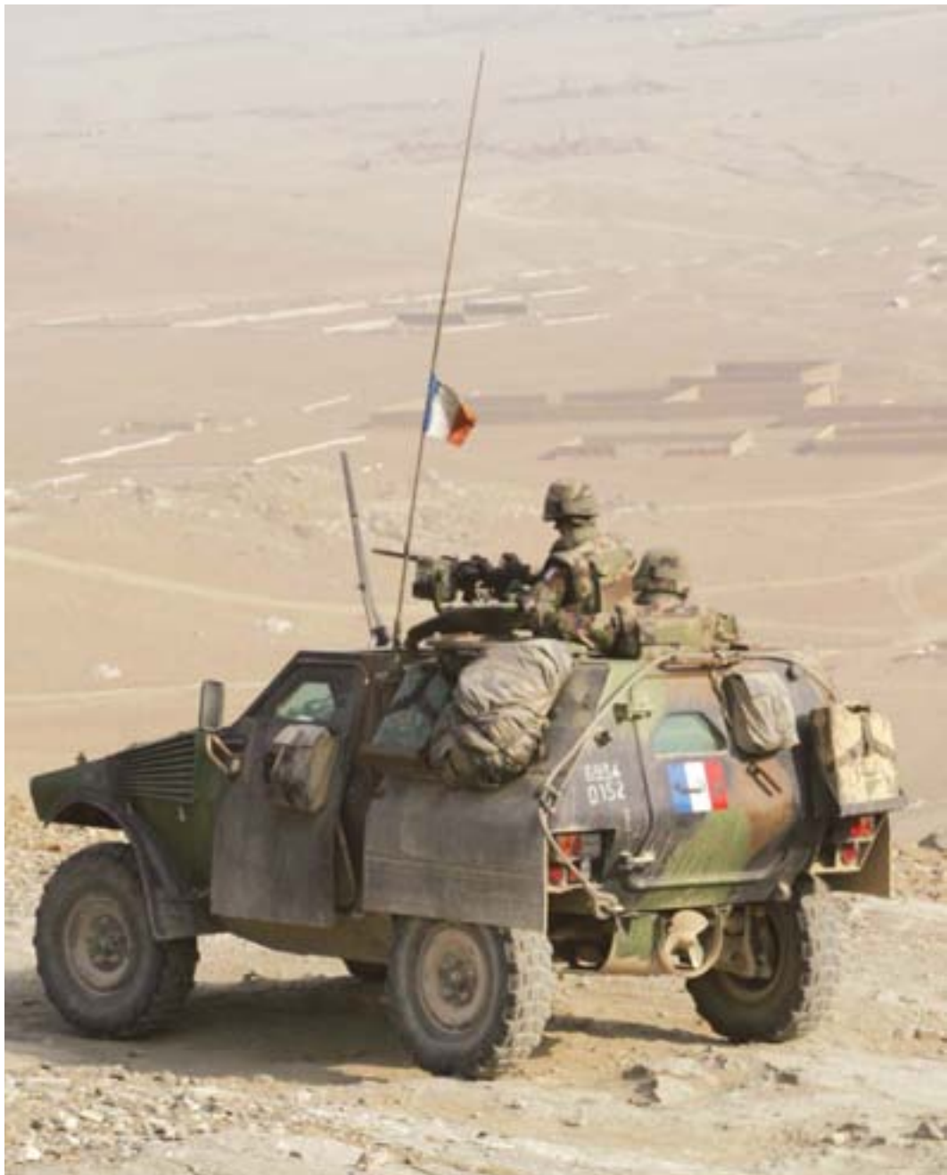
Panhard is under contract to supply 746 PVPs (Petit Véhicule Protégé) to the French Army although this number could eventually double

Nexter Systems unveiled its 2 tonne 4x4 Aravis multipurpose protected vehicle demonstrator at Eurosatory 2008. Based on a Unimog U5000 powered by 218 hp Mercedes Benz 4 cylinder diesel OM 924 engine the Aravis can achieve a top speed of 100 km/h, a range of 750 km and carry a driver, commander and up to six troops with their equipment. Aravis features appliqué armour, a V-shaped anti-mine plate and a spall liner within the crew citadel. Nexter claims that its new Safepro armour technology provides the Aravis with a level of protection which surpasses 'that of all existing 4x4 vehicles'. It describes this as '4-4-4': STANAG 4569 Level 4 ballistic protection able to defeat 14.5 mm threats; Level 4 mine protection able to defeat 10Kg mines; and, all-round Level 4 protection against 155mm artillery splinters. The vehicle can withstand an IED blast, equivalent to 50 kg of TNT, at five metres. Aravis has entered production following an €20 million order from the French Ministry of Defence earlier this year for the delivery of 15 vehicles, equipped with the Protector RWS, which will equip combat engineer units tasked with route clearance.