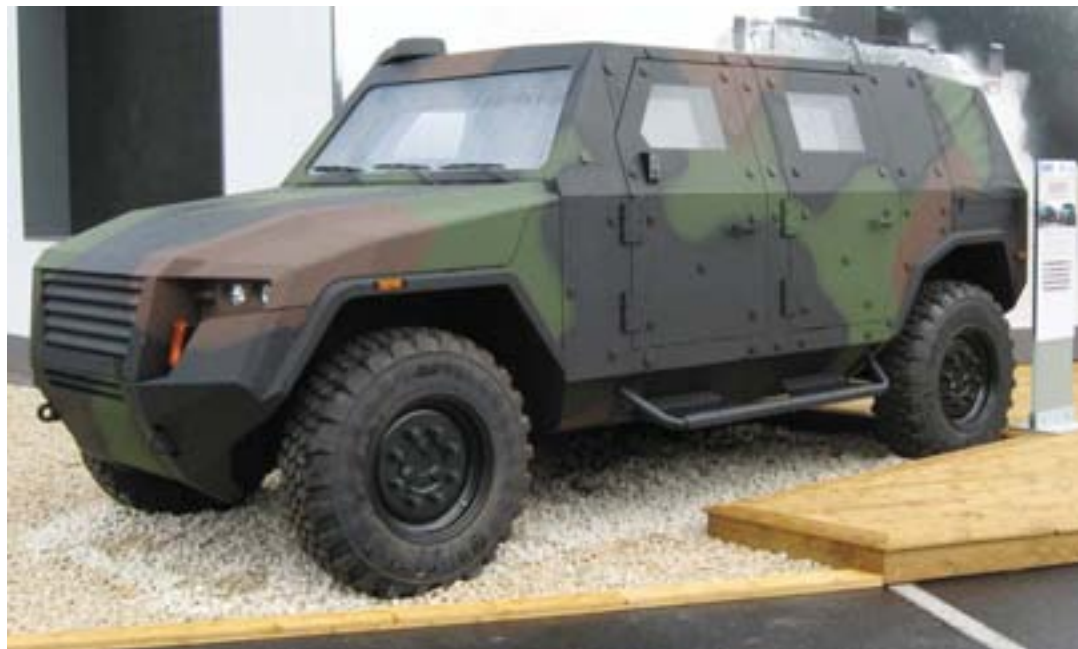
Krauss Maffei Wegmann and Rheinmetall are developing the 5 to 9 ton Armoured Multi Purpose Vehicle (AMPV) family which is intended to meet the Germany Army's GFF 1 and GFF 2 class armoured vehicle requirements; a mockup of the AMPV 1 was displayed at Eurosatory 2008

Krauss Maffei Wegmann and Rheinmetall are developing the 5 to 9 ton Armoured Multi Purpose Vehicle (AMPV) family which is intended to meet the Germany Army's GFF 1 and GFF 2 class armoured vehicle requirements