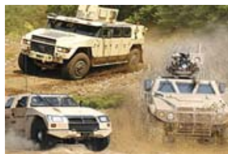
A US Army collage showing the three competing Joint Light Tactical Vehicle designs: Lockheed Martin (top); BAE Systems and Navistar Defense (bottom left); and, General Tactical Vehicles (bottom right). Each team will produce 10 technology demonstrators

Ambush Protected (MRAP) vehicles from several manufacturers to replace the HMMWV in Iraq. As the original MRAPs are too heavy and cumbersome to use for off road operations in Afghanistan the DoD is acquiring the lighter 4x4 MRAP-All Terrain Vehicle (M-ATV). TACOM LCMC selected Oshkosh's M-ATV design following the evaluation of six competing proposals and on 1 July 2009 awarded the company an initial $1.05 billion contract for 2,244 M-ATVs and a month later placed a $1.06 billion delivery order for another 1,700 vehicles. There is speculation the eventual requirement could approach 10,000 vehicles. By the end of July Oshkosh had built 46 M-ATVs and plans to ramp up production to 1,000 vehicles per month by December. The 15 ton M-ATV is based on the chassis of the Medium Tactical Vehicle Replacement truck, incorporating the TAK-4 independent suspension system, that